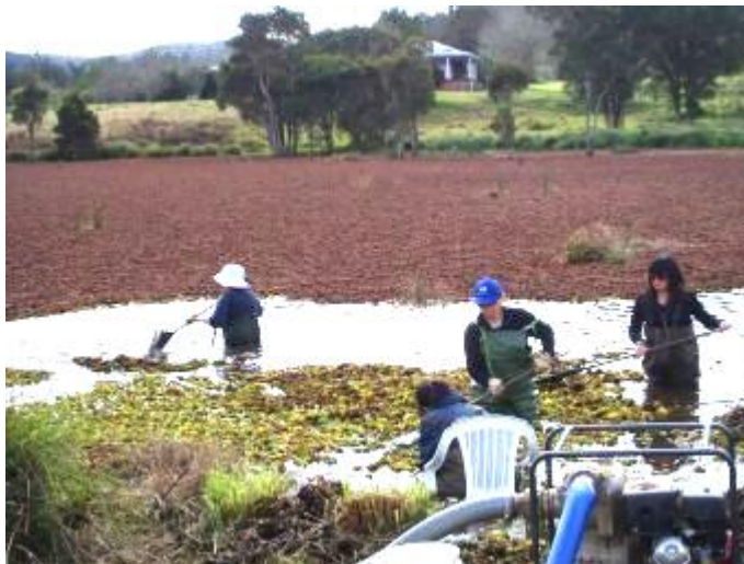
CVA volunteers use rakes and a pump to remove Salvinia near Wollombi, July 2008

In late July a team of young volunteers, one of many recruited from throughout the world to work on conservation projects throughout Australia by Conservation Volunteers Australia (CVA) started to tackle the Salvinia, a noxious water weed originally from Brazil, that is choking the wetland next to Avoca House on Wollombi Road. These projects in natural areas always present challenges and this was no exception. However, despite the cold and rain the group has made a sizable hole in the infestation. It was unrealistic to expect much more from a few days work.